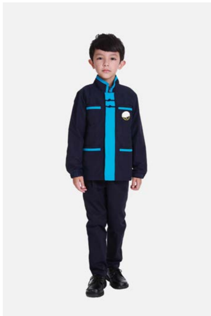
藏藍繩結鈕扣針織外套 NAVY BLUE KNOT BUTTON CARDIGAN