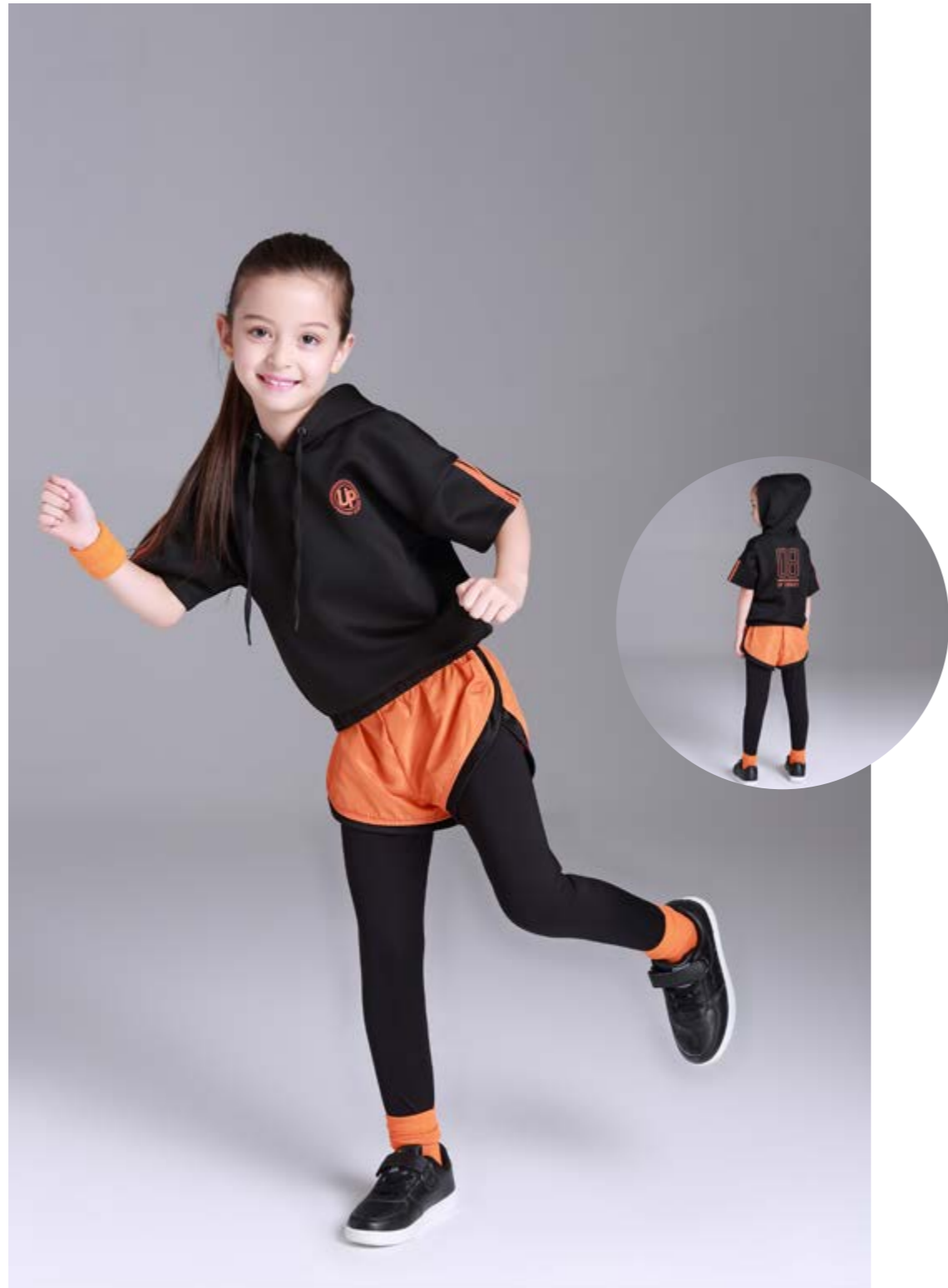
牛角袖運動套裝配緊身打底褲 RAGLAN SLEEVE T SHIRT SPORTS SET WITH LEGGINGS