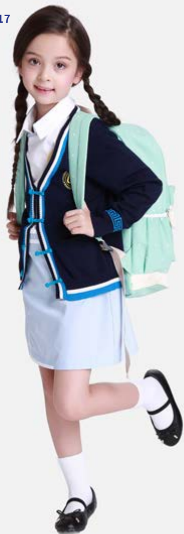
襪衣領旗袍校裙 CHEONGSAM UNIFORM WITH SHIRT COLLAR