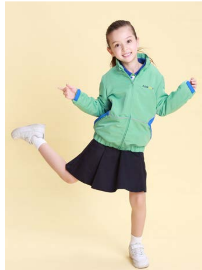
粉綠風衣運動校褸套裝 PASTEL GREEN SCHOOL JACKET SET