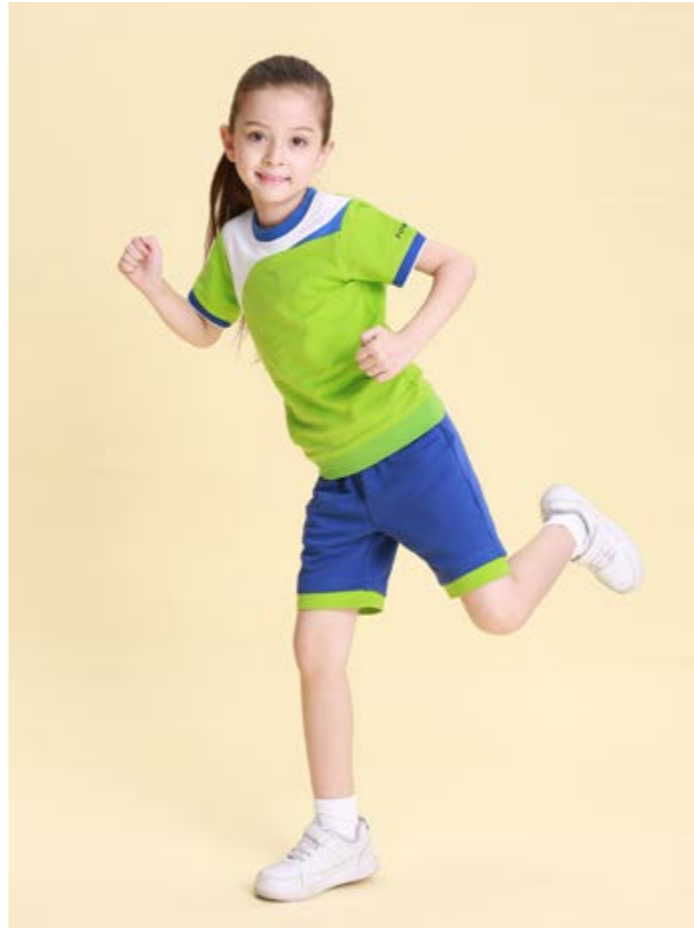
夏季青藍拼色運動套裝 SUMMER MULTI-COLOR SPORTSWEAR SET